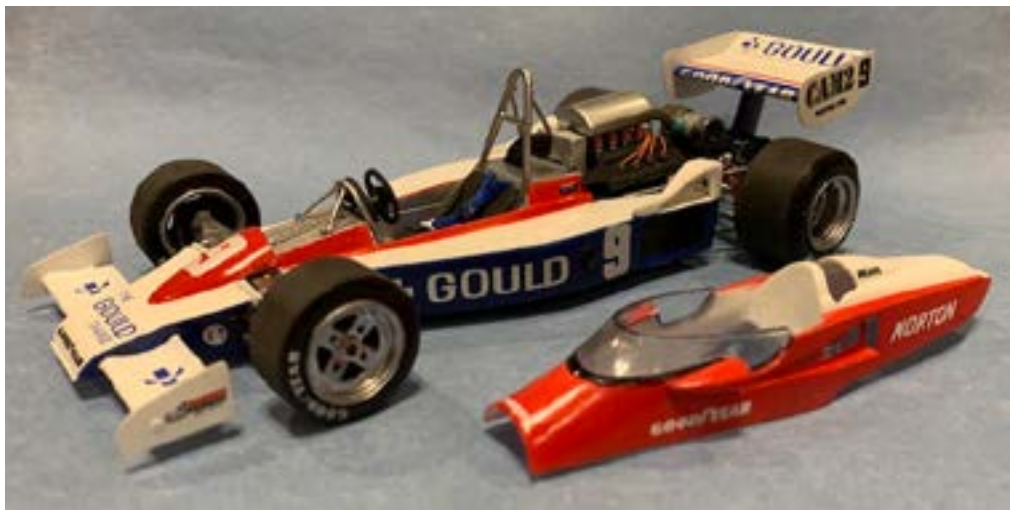
(above) One of the nice features is the removable body top. It does make a nice display.