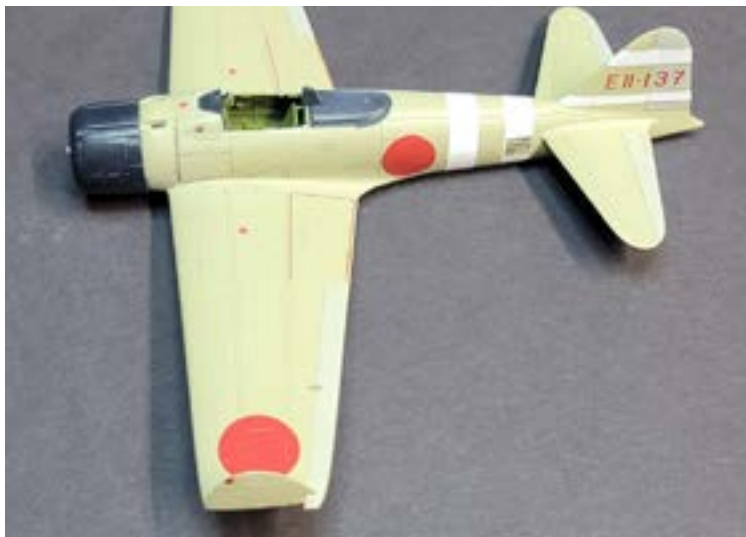
(above) Airfix 1/72 A6M2b Zero-zen with folded wing-tips for carrier storage, built by William Reece. Based on Zuikaku for the Pearl Harbor attack.