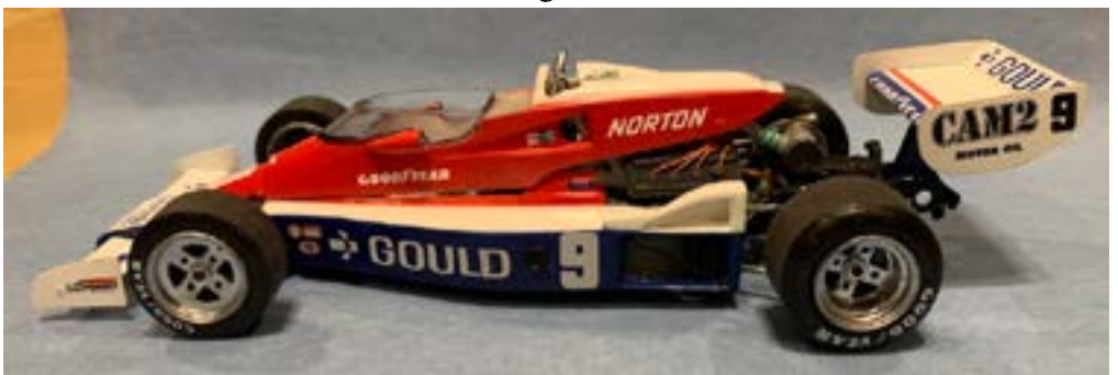
(below) And a side view of the assembled vehicle ready to roll out of the pits and onto the track. It IS a nice looking build, Dennis.