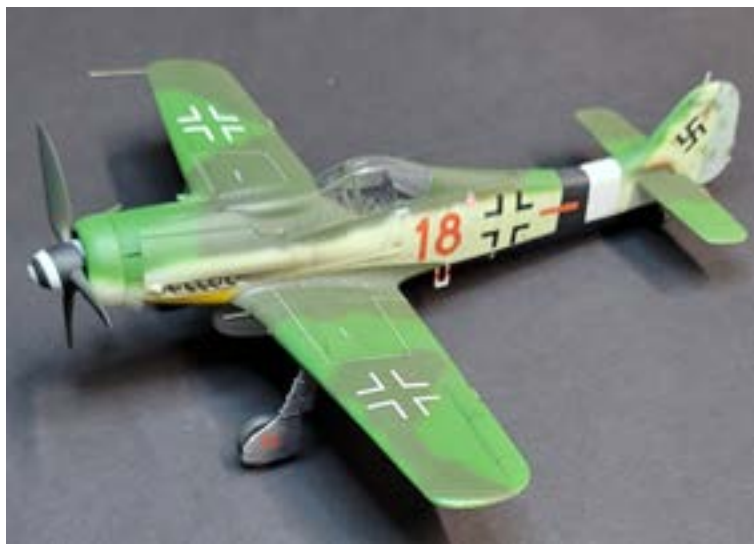
(above) 1/48 FW-190 D-9 with wheels and decals from third party suppliers. Brown 18, JG-26 1945.