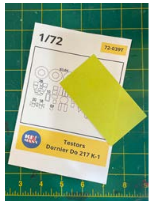
(above) One of the nice features is the removable body top. It does make a nice display.

I started selling them on the Scale Model Graveyard weekend Auctions and they started to sell quite well. I did notice though that the subjects that I thought would sell well (obscure Luftwaffe stuff) was not everyone's interest. The items that I (continued on page 11)