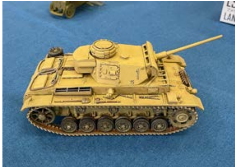
(above) The side view shows the extra applique armor the Germans had to resort to in response to the increasingly tough allied armor effectiveness.