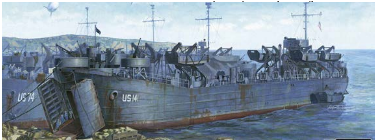
(above) Jim also brought in a teaser, the AFV Club 1/350 Type 2 LST-491 Class – new kit that he will start to build sometime in the near future. This is a build your editor is interested in following.