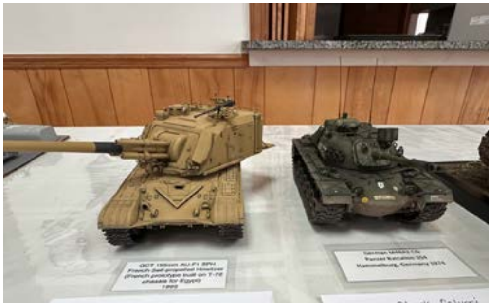
Latest from the Colucci Panzerwerks are these two AFVs in 1:35. Far left is a prototype French build based on a T-72 chassis called a GCT 152mm AV-F1 AFV. It's a Hobbyboss release of a one-of built for Egypt in 1995. Production did not ensue. Nearer left vehicle is a German M-48A2 from Panzer Battalion 354 based in Hammelburg in 1974