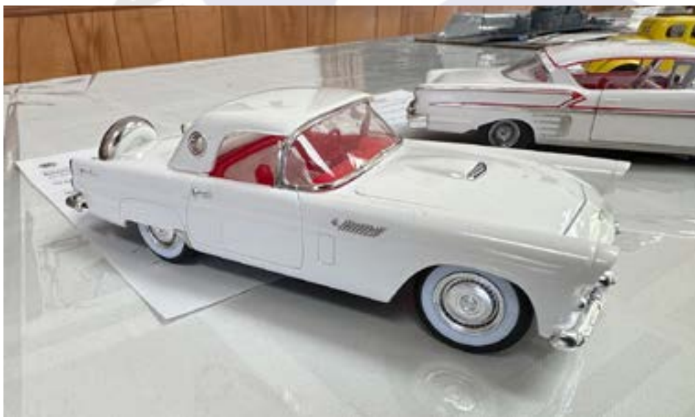
(left) AND the coupe d'resistance, the 1956 Ford Thunderbird Suzanne Sommers drove in the film. The Revell kit is produced in 1:24 scale but it sure fits in with the rest of the group.