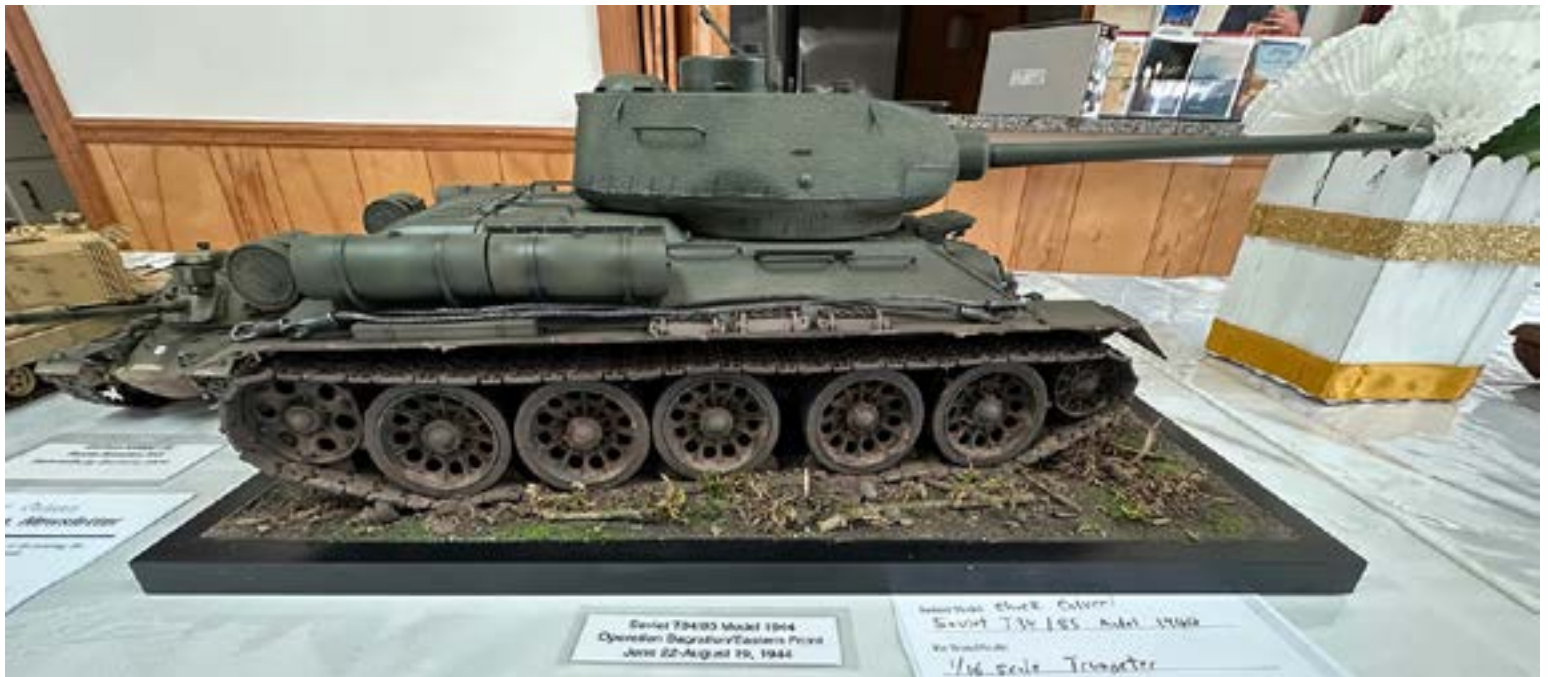
(Above) Chuck Colucci's massive T-34/85 in 1:16 scale. Marked as in Operation Bragation in June/July 1944.

(right) Dennis Korn's 1965 Indy Lotus, built out of the box except for replacement tires and decals and seat. It was interesting to follow Dennis through the travails of the construction. 1:25 scale kit by IMC.