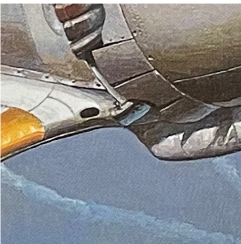
Section two, March