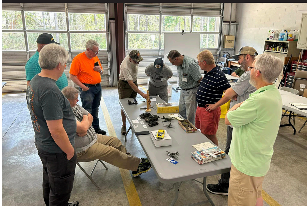
(above) Model talk at the fire station. Most of the group discussing the pros & cons of different kits and building styles in a non-standard meeting location.