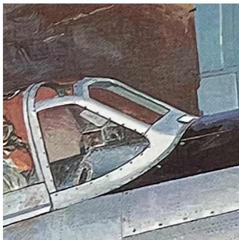
Section one, February