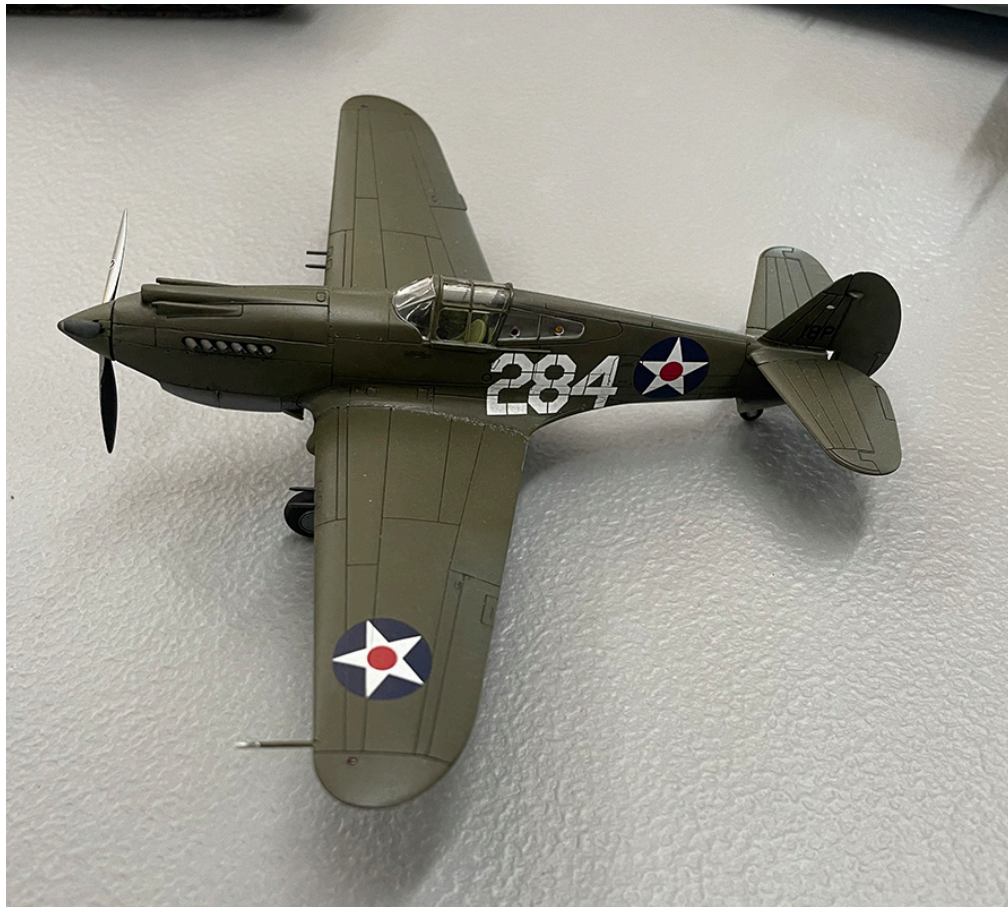
(top) William Reece brought in two aircraft in two scales. First up is an Airfix 1/72 Curtiss P-40B marked as it was during the Pearl Harbor attack. These are kit decals for one of the current Airfix issues.